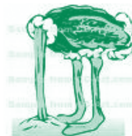
"Don't take the ostrich approach!"

W e understand that from time to time members can hit financial bumps in the road. We are willing to work with them to get through those times, but all too often members take what we call the "ostrich approach", putting their head in the sand hoping the problem disappears. That approach can only lead to more problems. We will begin nonpayment disconnections shortly, so if you are behind it's important you contact us immediately to make satisfactory payment arrangements. Failure to do so can result in the possible disconnection of your electric service and collection fees added to your account.