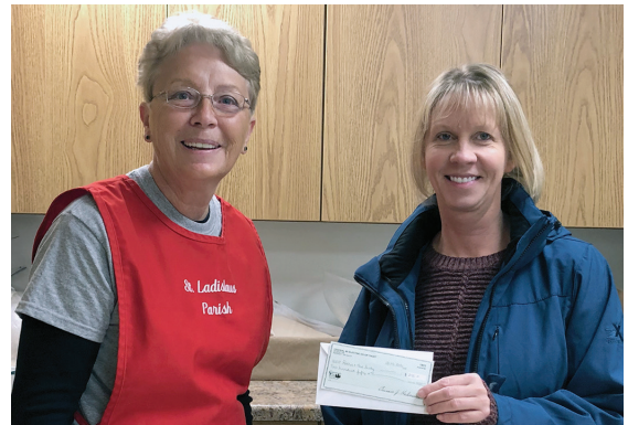
Rosholt Food Pantry