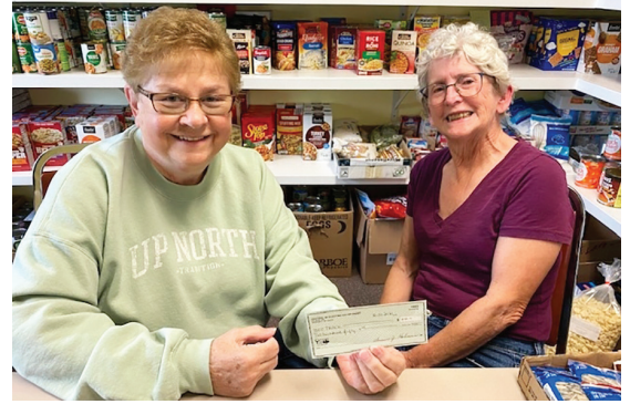
TRACK Tomorrow River Food Pantry