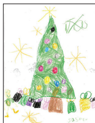
First Place Jasper Poppe