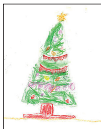
Second Place Ethan Popp