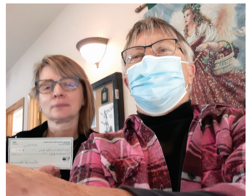
Scandinavia Food Pantry