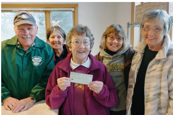
Wittenberg Food Pantry