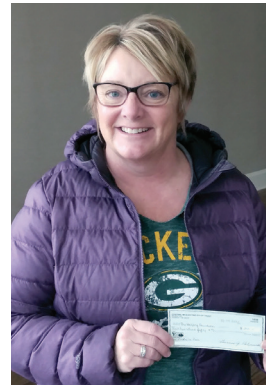
The Helping Foundation