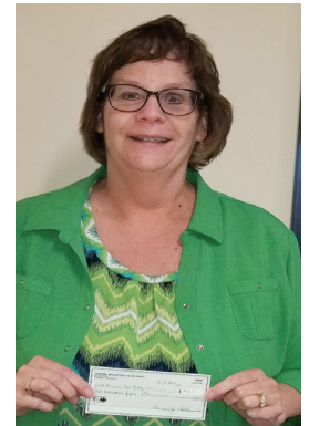
Marion Food Pantry